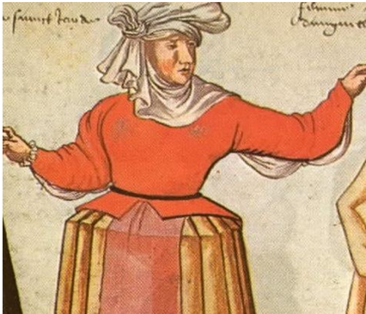
Another gonete/hooped petticoat/giant turban ensemble