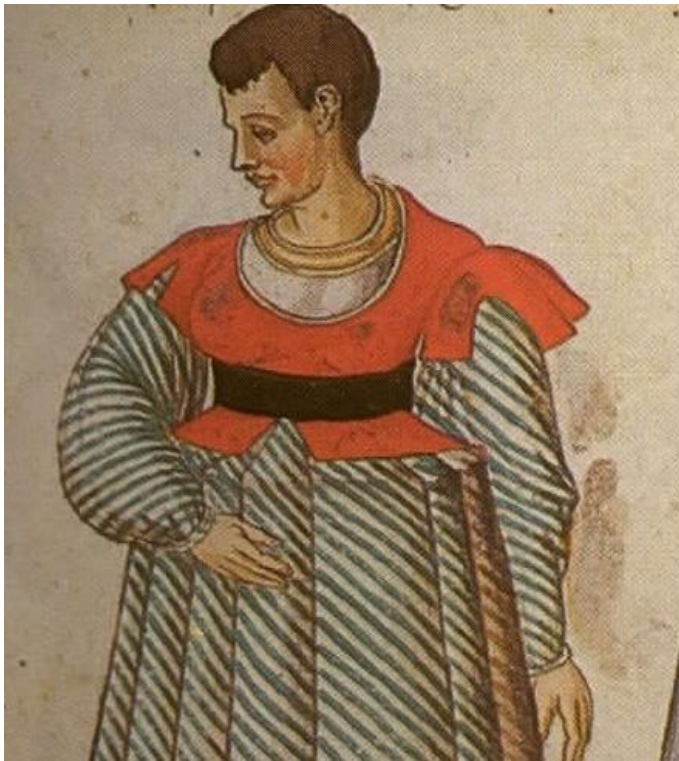
A woman with cropped hair