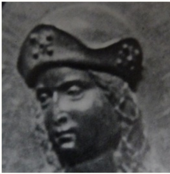
Figure 5 Media gorra