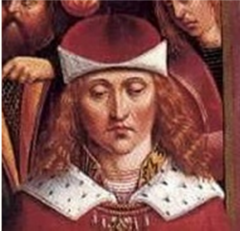
Figure 3 Media gorra