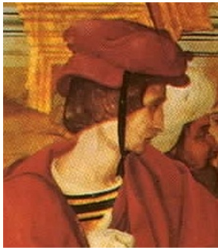
Figure 6 Bonete