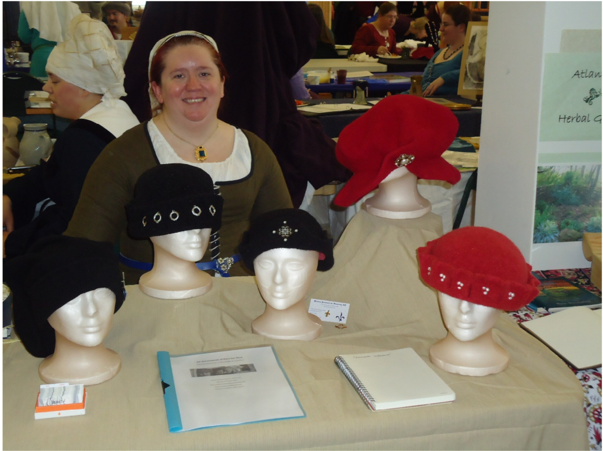
Kingdom A&S 2012 display featuring two medias gorras , one gorra , a flat-crowned boneto , and a bag hat made of woven and fulled wool.