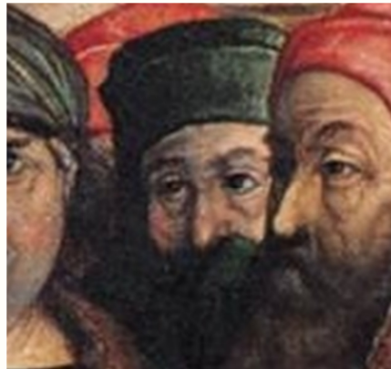
Figure 2 Gorra