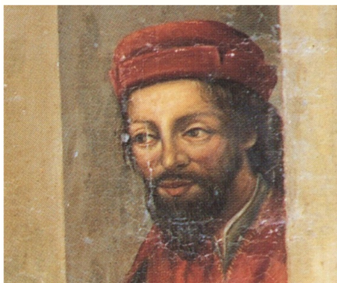
Figure 1 Media gorra